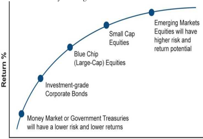
Risk % (Standard Deviation)

The relationship between the risk of the rates of return to different kinds of securities and the rate of return expected by investors who hold those securities is illustrated by the diagram below: